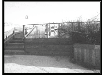
Newly renovated beach entrance at Pennsylvania Avenue

All of you know by now how I feel about learning the facts. And the best way to do so is by attending our monthly West End Neighbor Civic Association meetings.